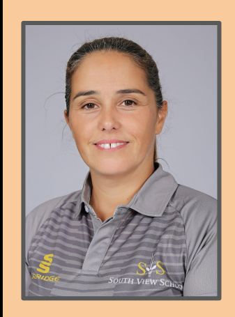
Please view your Year Group page for swimming and PE days