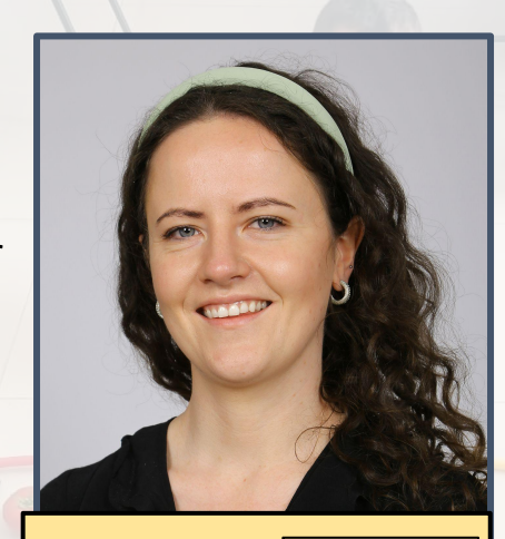
Value of the month: Kindness Islamic value: العطف Learning Skills Focus

In science, we looked at food chain and the role played by producers, prey and predators.